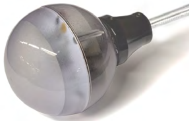
MaxiLED Large Globe series RGBW DMX